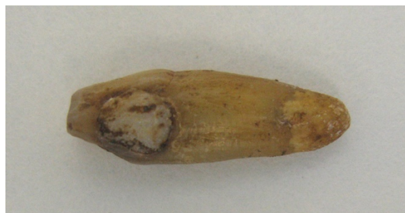
Figure 1 The photograph of the analysed tooth of General Władysław Sikorski (World War II).

Samples S25 and S26 came from two skeletons revealed during conservation work conducted in the Church of St. Andrew in Kraków in 2011. The church of St. Andrew was built between 1079 and 1098, and represents a great example of the Romanesque style. Two medieval skeletons were found under the floor between the chancel and the nave of the church. Based on historical markers the grave was dated to originate from the 14th century. Further anthropological examinations indicated that the S25 male died at the approximate age of 60, whereas the S26 male was approximately 75 years old at the time of death. It is alleged that the skeletons belong to members of the Tęczyński family, representing noble Polish magnates of medieval times. The tooth collected from the deeper burial (S25) was found to be seriously affected by decay, which was reflected by a very low DNA concentration (3 pg/ \mu l) and incomplete autosomal and Y chromosome STR profiles (NGM and Yfiler). Complete mtDNA HVI and HVII profiles were generated in both teeth (data not shown). From these data it was possible to conclude that both skeletons are of male origin and are unrelated in both maternal and paternal lines. From the partial HirisPlex profile